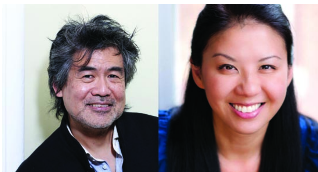
Curator David Henry Hwang