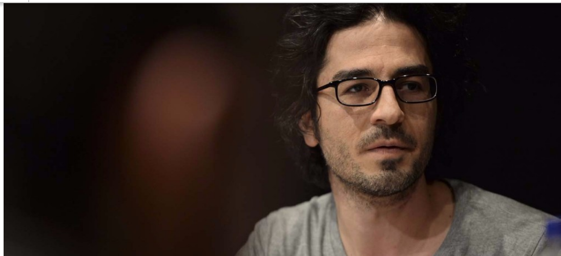
Playwright Mehdi Moradpour