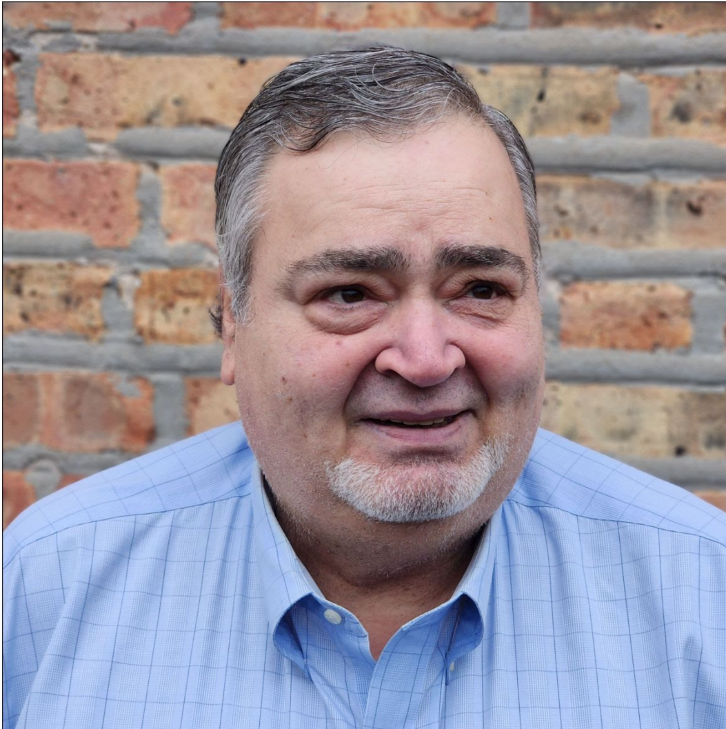
Playwright Fouad Teymour

The IVP staged reading of Egyptian Bride will begin on June 19th at 6:30 pm, followed by a question and answer session, moderated by Silk Road Rising's Jamil Khoury. It is free and open to the public and no RSVP is required. To learn more about the festival, click HERE .