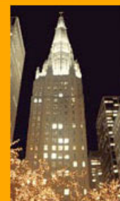
The Professional Theatre-in-Residence at The Historic Chicago Temple Building

365 Jams with Silk Road Theatre Project! Enjoy a Theatre Jam Session comprised of seven brief, brilliant, tragic and hilarious short plays written by Pulitzer Prize winning African-American playwright Suzan-Lori Parks. Silk Road inspired music (spun live), Indian dance, poetry and vibrant paintings will weave together these thrilling new works by one of America's most inventive and provocative playwrights.