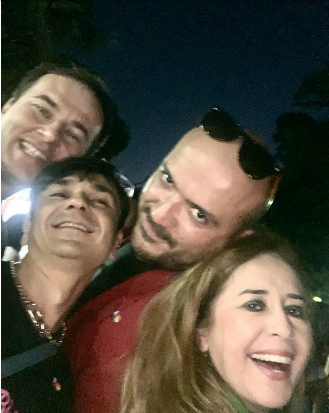
Alternative Pride in Istanbul with SU Gender Team and LGBTI+ activists. Pure Joy! (July 2022)